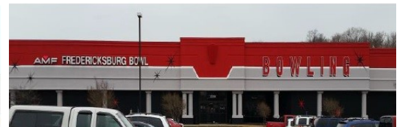
AMF Fredericksburg Lanes