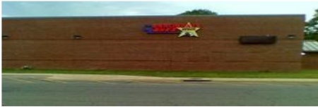
Cannon Ball Lanes Dahlgren