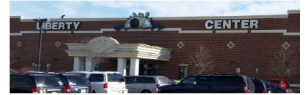
Liberty Center Massaponax