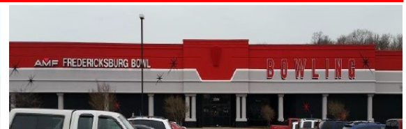
AMF Fredericksburg Lanes