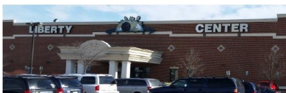
Liberty Center Massaponax