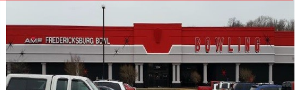
AMF Fredericksburg Lanes