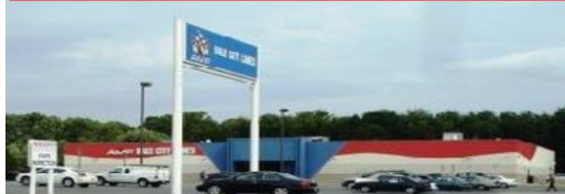
AMF Dale City Lanes Woodbridge

Contact us Greater Fredericksburg USBCA 17 Ashland Circle Fredericksburg, VA 22406 (540) 287-4545 AMGFUSBCA@gmail.com Visit us on the web at GFUSBCA.org