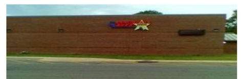
Cannon Ball Lanes Dahlgren