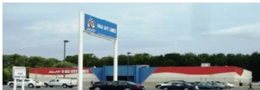
AMF Dale City Lanes Woodbridge