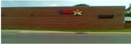
Cannon Ball Lanes Dahlgren