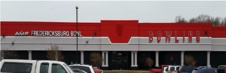
AMF Fredericksburg Lanes

Any GFUSBCA member can and are encouraged to submit articles, announcements, etc. for this newsletter. If you have an event/news, please email the Association Manager.