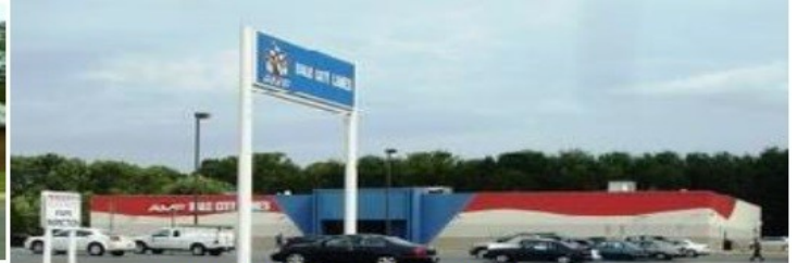
AMF Dale City Lanes Woodbridge