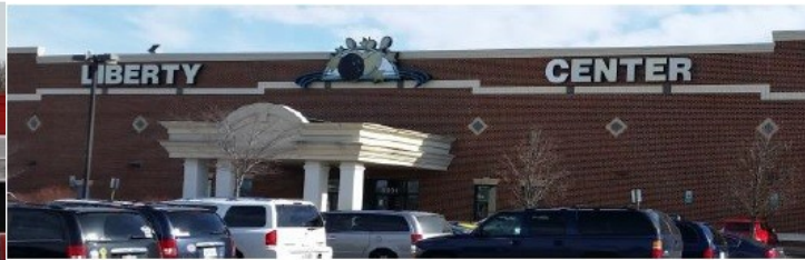
Liberty Center Massaponax