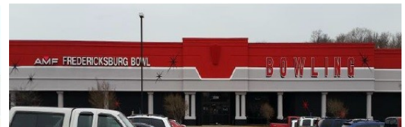
AMF Fredericksburg Lanes