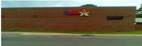
Cannon Ball Lanes Dahlgren