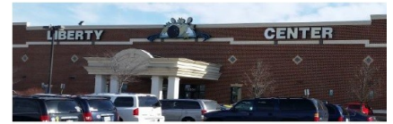
Liberty Center Massaponax