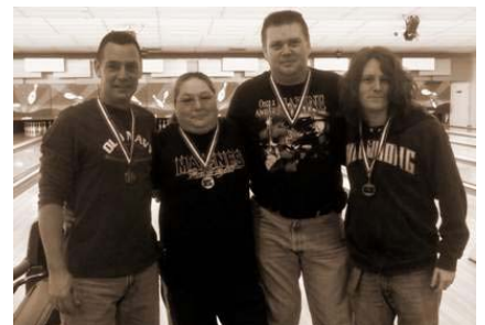
3 rd Place