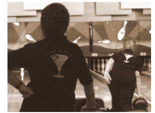
Left: Tournament practice begins. Right: Team members of Cinco de Mayo concentrate.

well as the men's. Many of the comments concerned having divisions by age group and the establishment of a women's division. It was also suggested that the average of