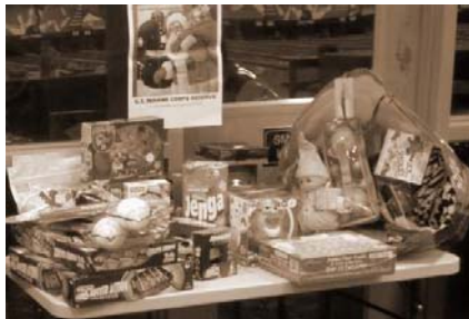
Above: Toys donated by Guys & Dolls

generosity into December when the bowlers collected and contributed toys to Toys for Tots. Thanks to everyone who contributed and GREAT JOB !