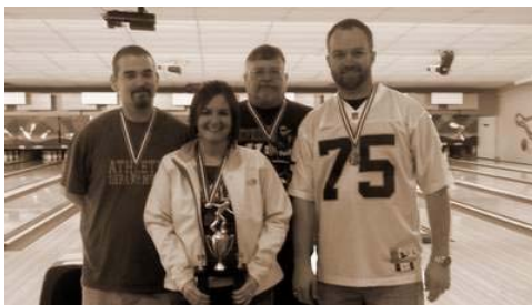
1 st Place