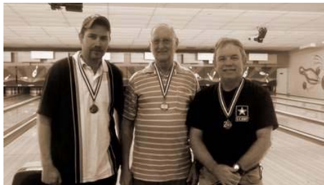
2 nd Place