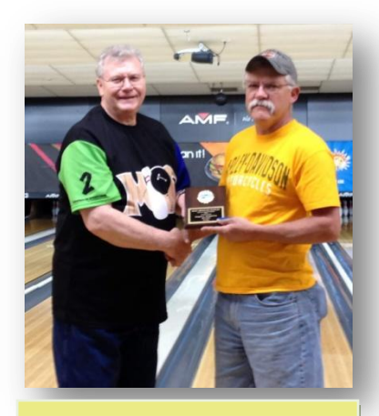
The Fuzzy Fox smile!